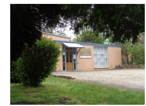
The Church of the Ascension, 2 Arkaba Road, Aldgate

The Church of St. Michael and All Angels, 435 Mt. Barker Road, Bridgewater