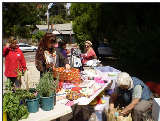
Some of the stalls at the March market