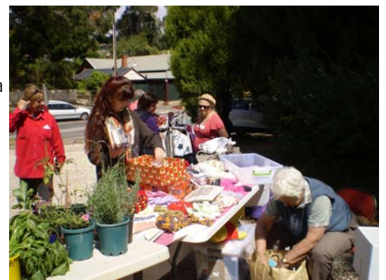
Some of the stalls at the March market